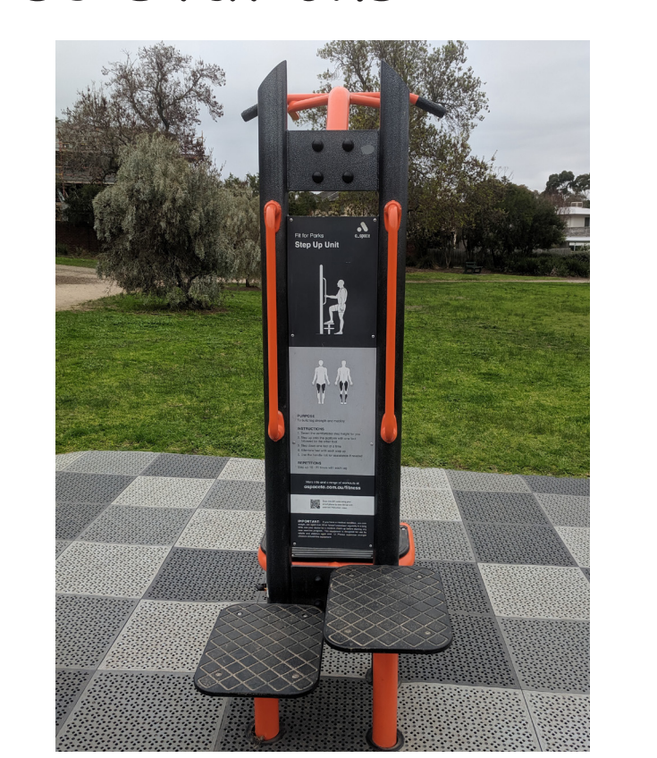
Exercise station 2a.