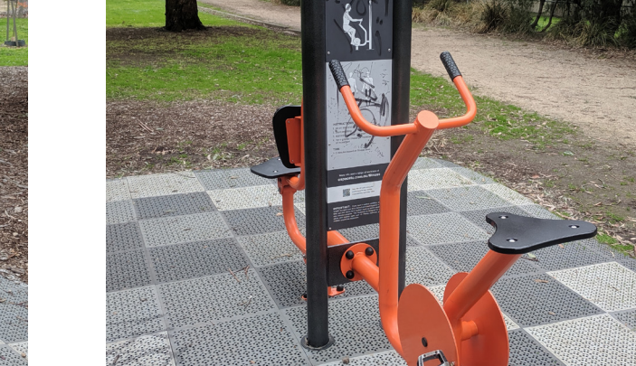
Exercise station 2b.