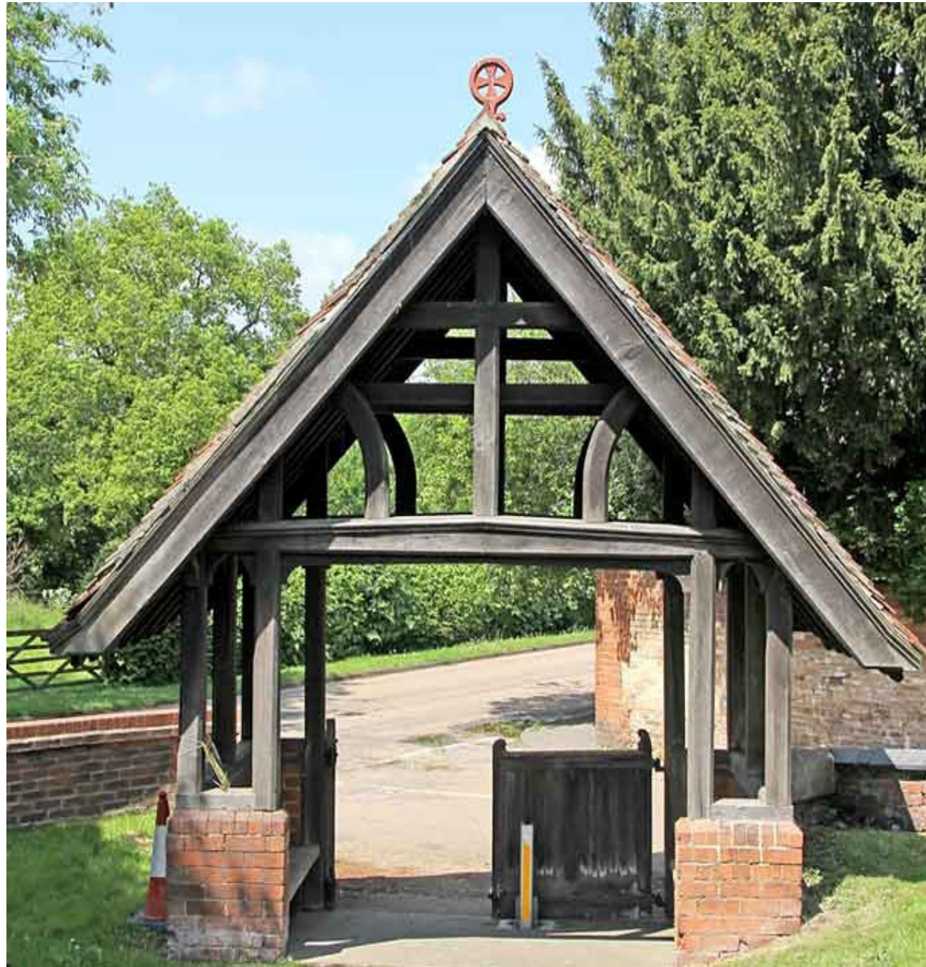
1. New entry portal with external gathering space, seating and evocative (but easy to operate gate) and welcoming art installation