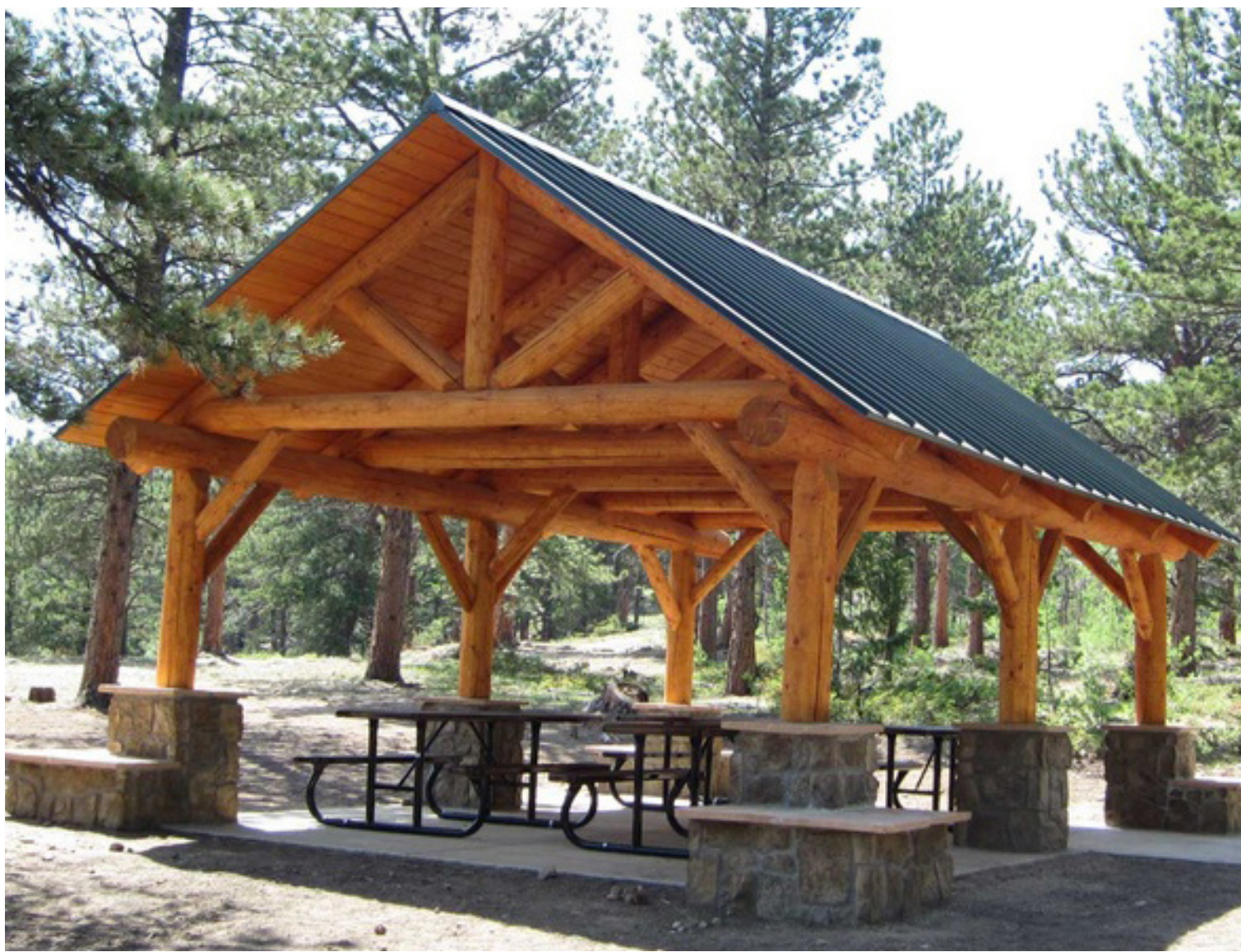
5. Shelters with slab and accessible picnic table (5a)