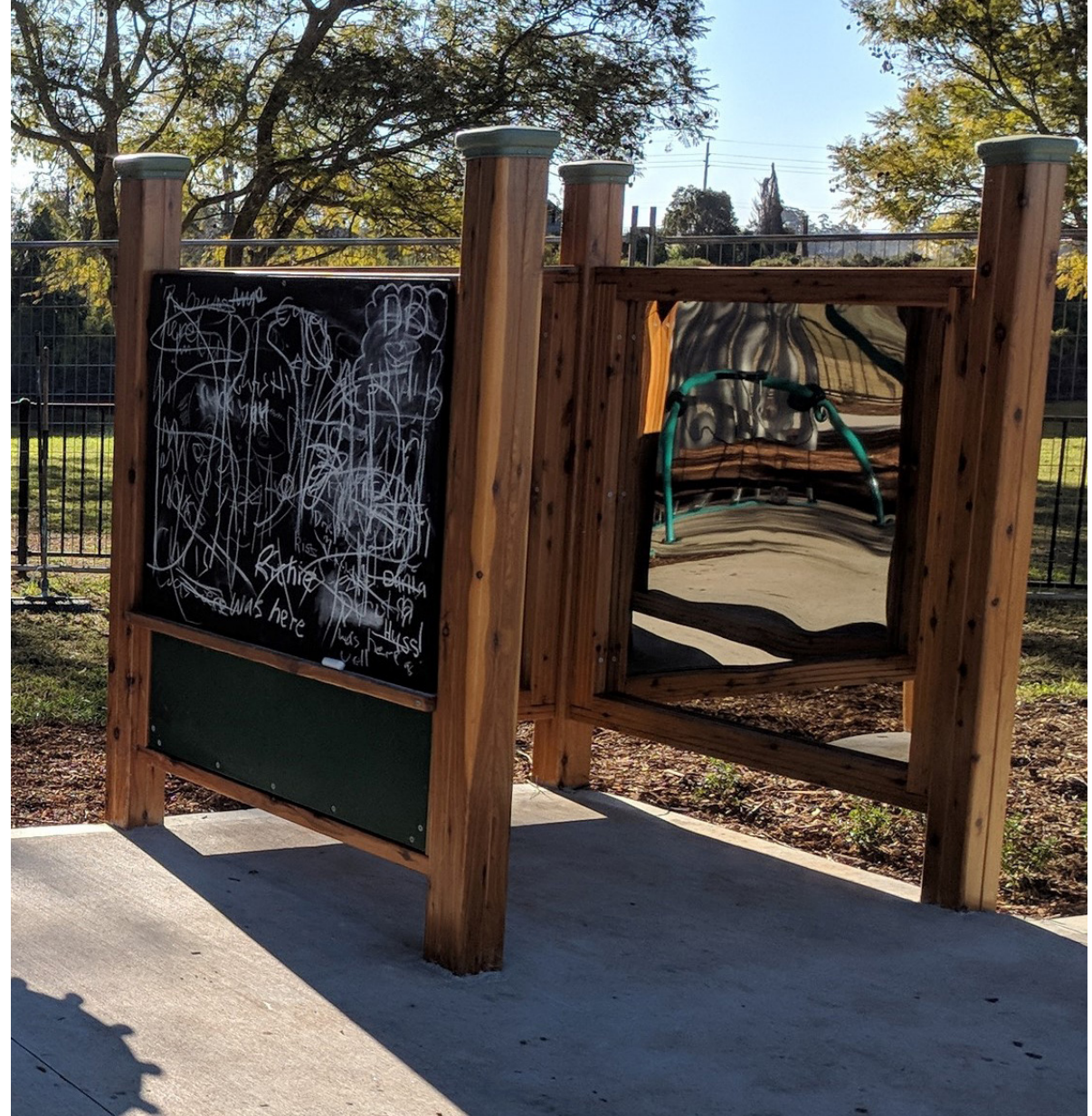
15. Shiny distorting mirror in timber frame