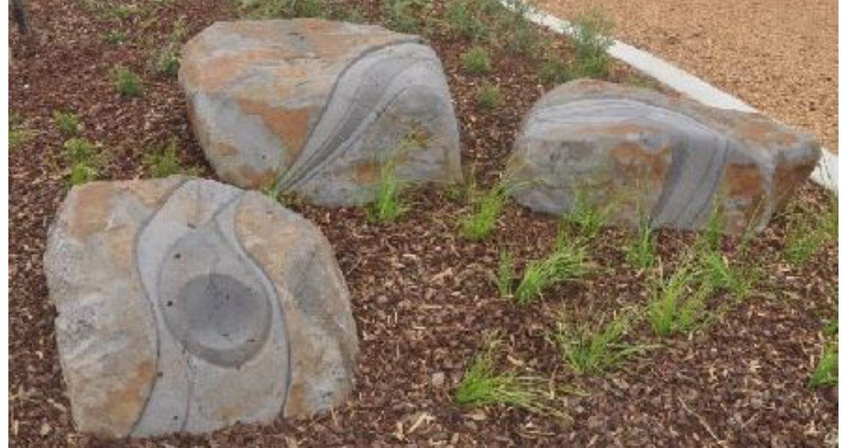
13. Random rock clusters for informal sitting and contemplation