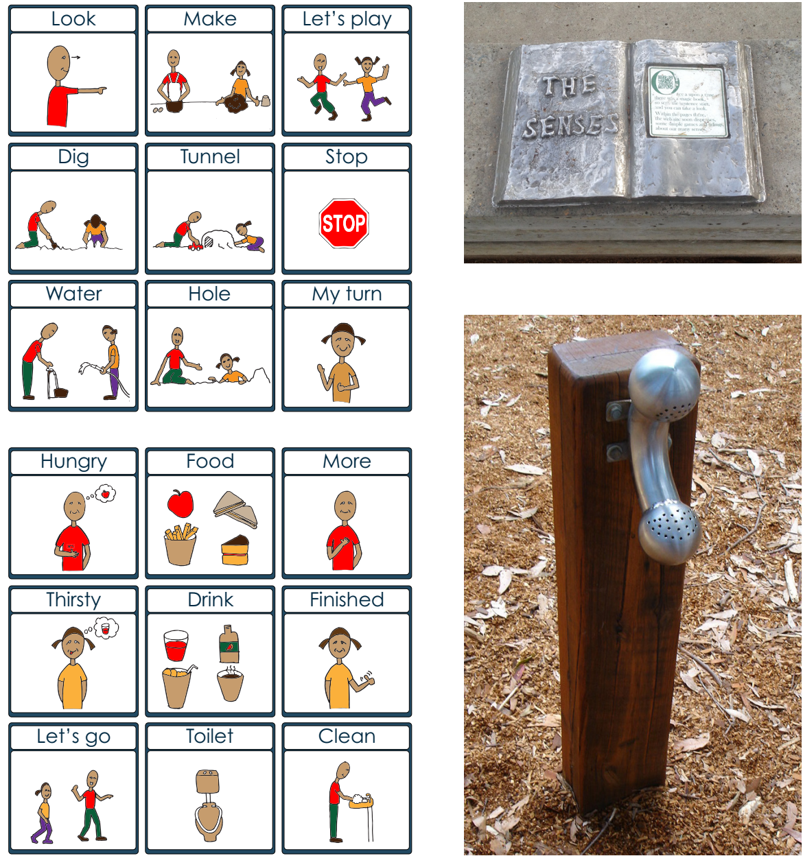
9. Discovery, communication and dexterity elements in central square