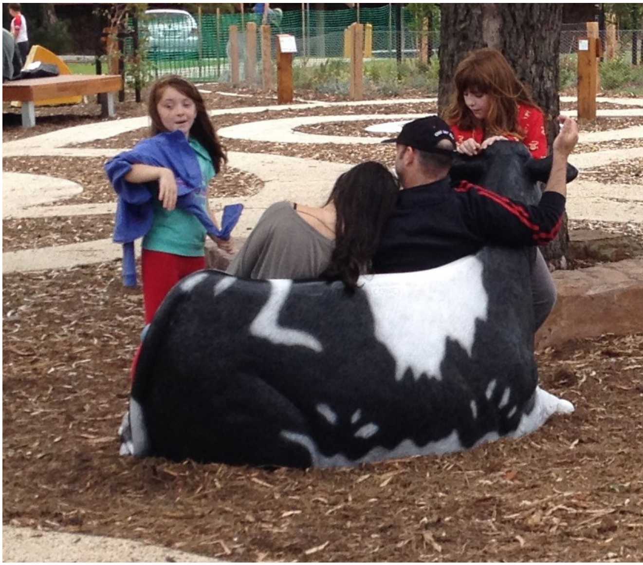
7. Cowch and assorted tomatoes and crops for imagination play and sitting on artificial turf