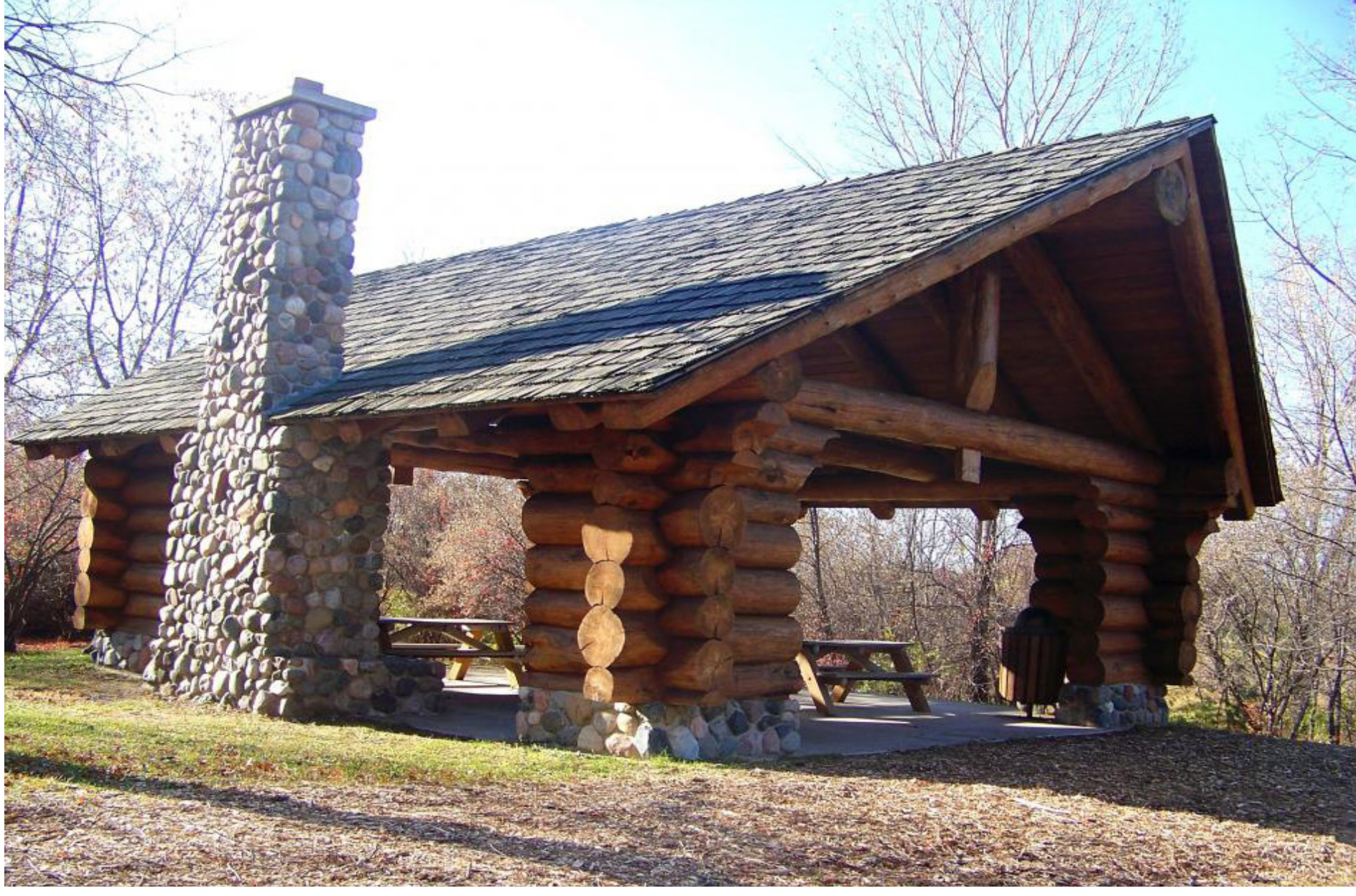
12. Extra-large shelter with accessible picnic tables