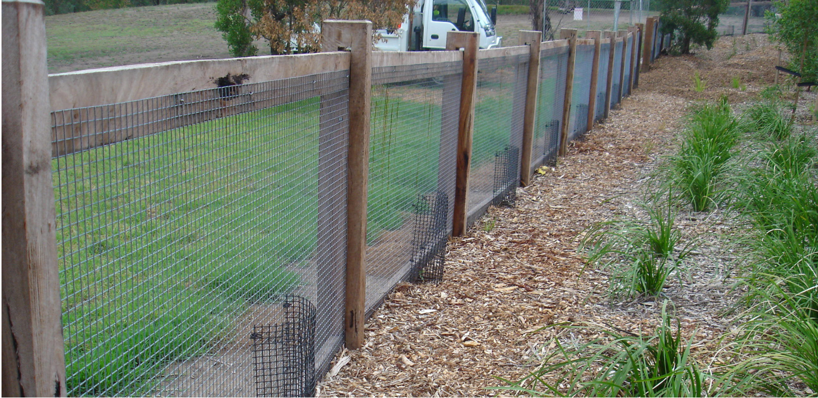
2. Timber post, rail and mesh fence with salvaged turrets (2a.) at regular intervals along boundary, and low native planting and climbers