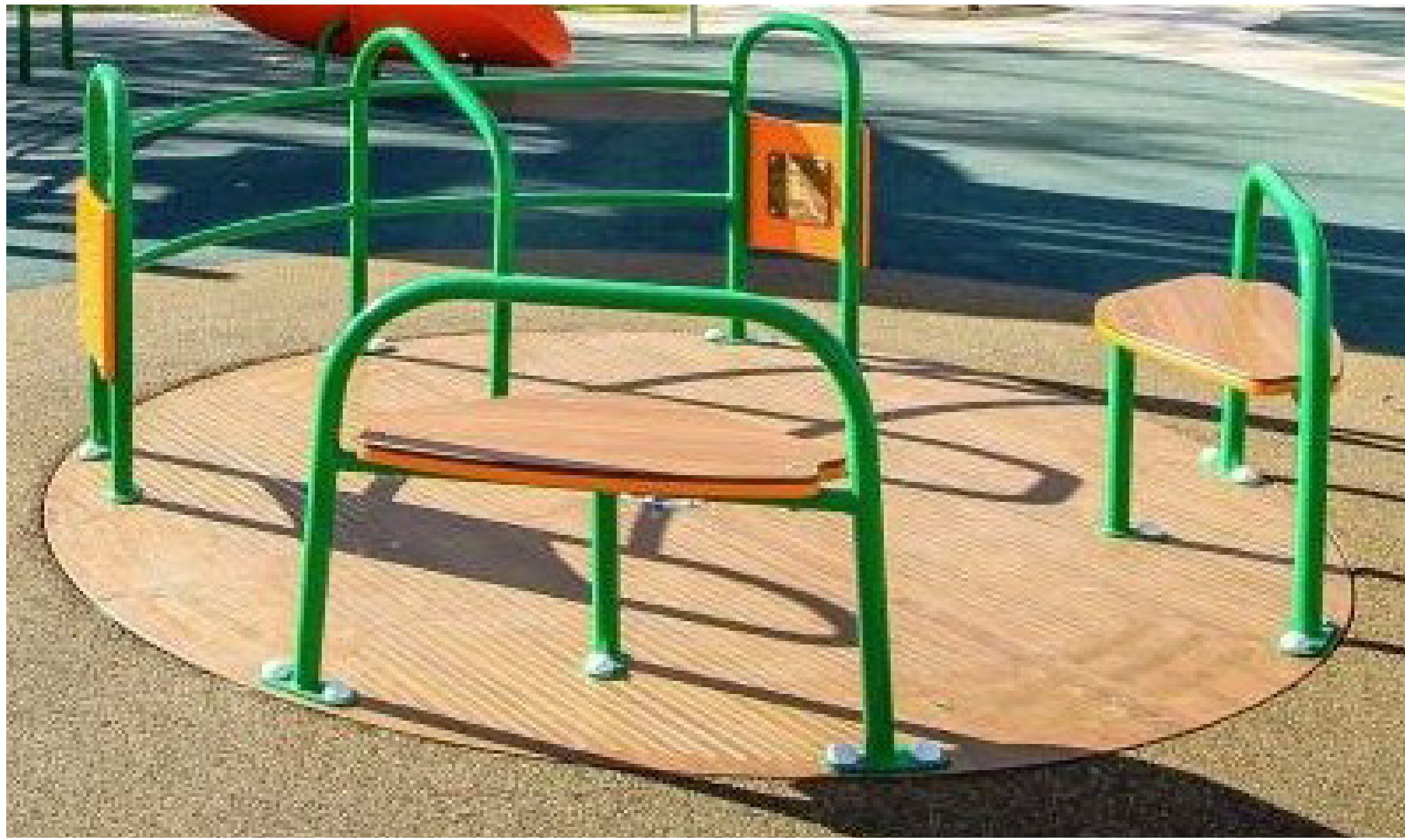
10. Large accessible carousel with wetpour rubber surrounds