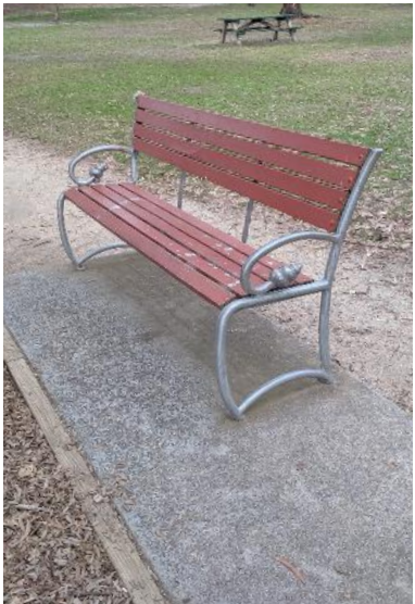
5. Seats with backs and arms on extended pad for wheelchairs/walking frames/mobility scooters