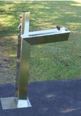
2. Accessible water fountain