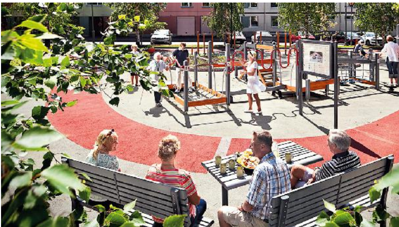
3. Specialised seniors exercise circuit on rubber surface with shade cover, and equipment as illustrated below