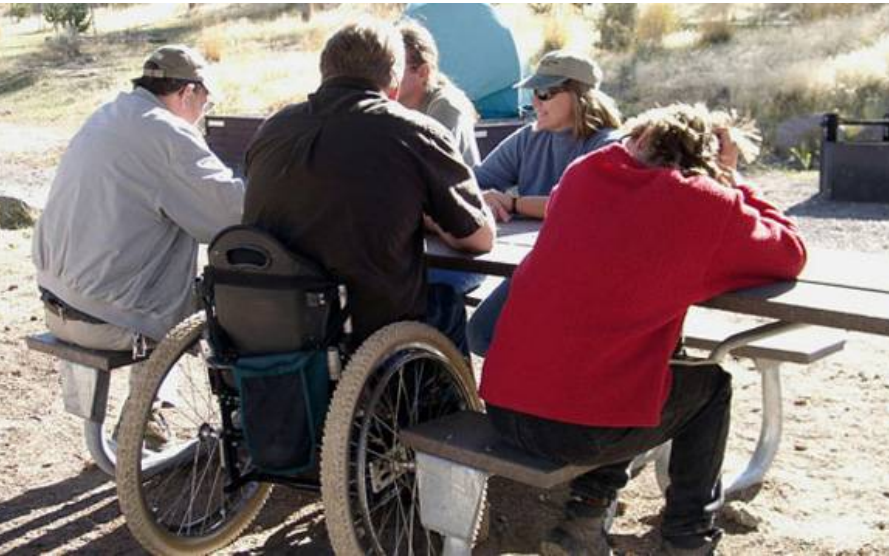
4. Shelter on concrete pad with accessible park furniture and additional space for mobility scooters