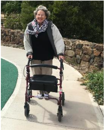
1. 2.1m wide level concrete link pathways to circuit path and link to playspace