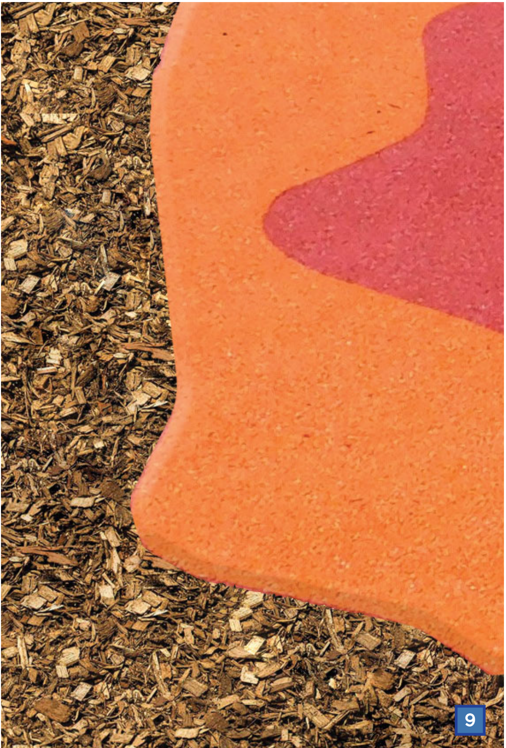
Play equipment / furniture