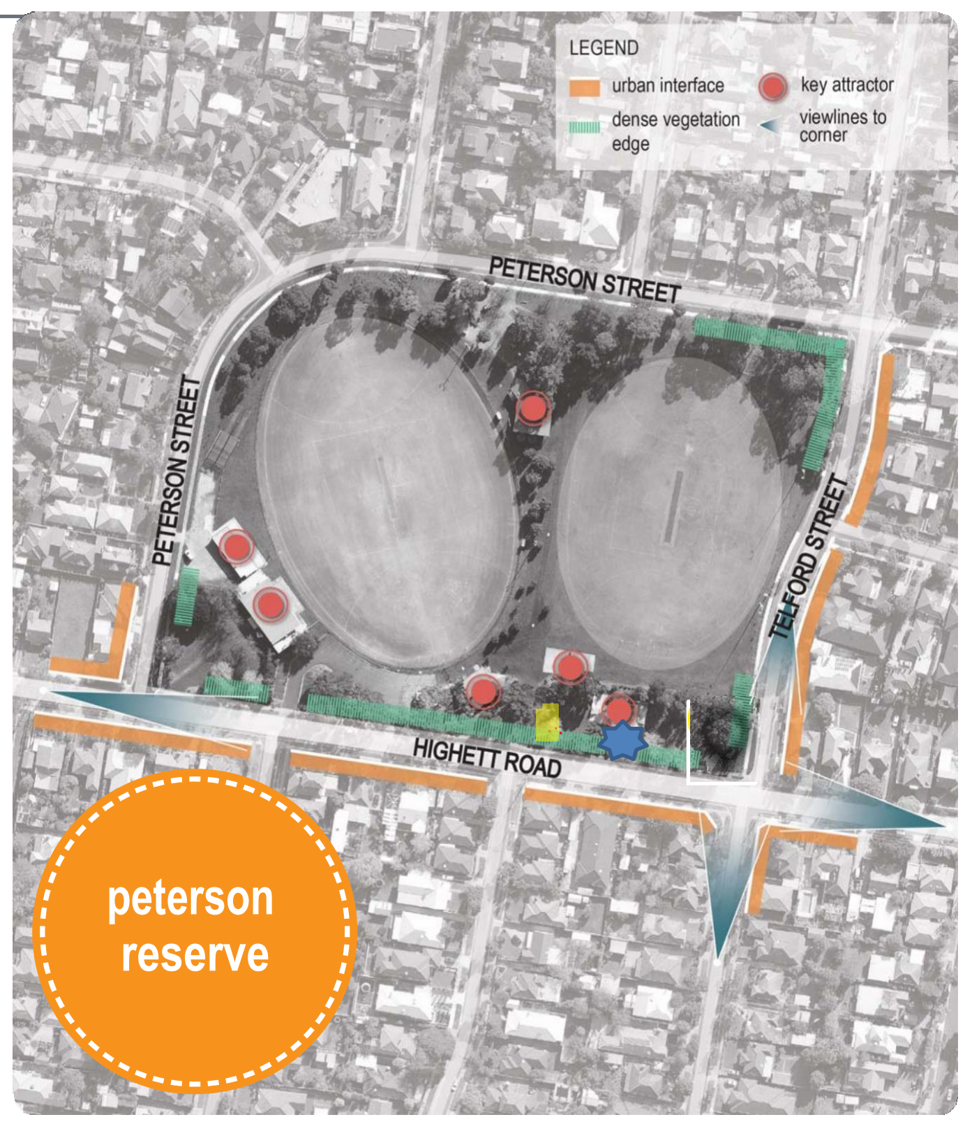
figure 8: peterson reserve site selection criteria