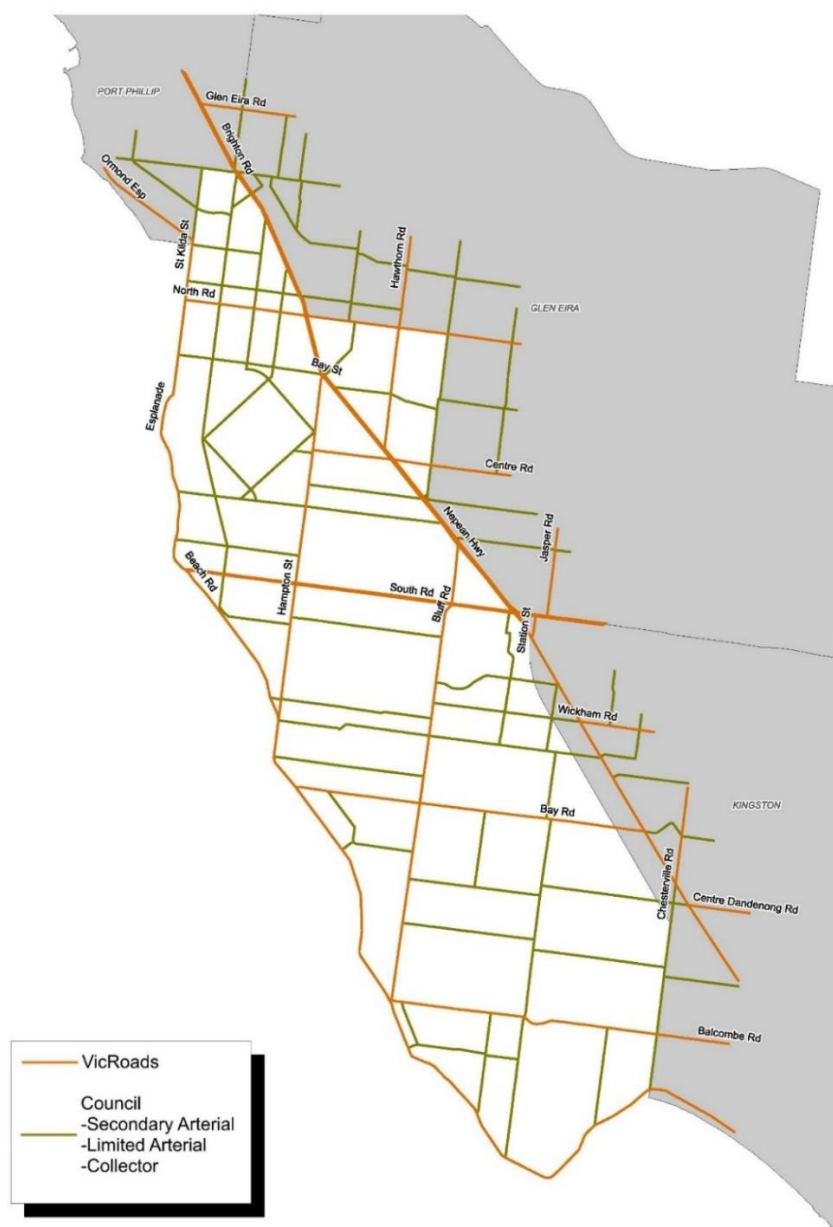
Figure 1. Bayside City Council road network (local and minor roads not shown)

Bayside is a primarily residential area, with several light commercial activity centres a small light industrial area. In 2021, the estimated resident population of Bayside was 107,566.