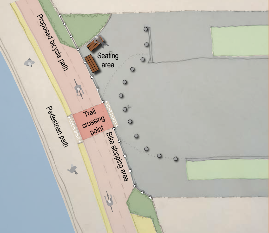
Bay Trail / Bay Street Intersection

The proposed modifications to the Bay Street intersection are intended to: • Create a single trail crossing point clearly defined by line marking and with open view lines in both directions • Create spaces to the side of the trail for pedestrians and cyclists to stop without obstructing other trail users. • Additional space for pedestrian and cycle stopping and circulation is made available by a minor reduction in road area, moving the bollards approximately 2 metres east of their existing locations.