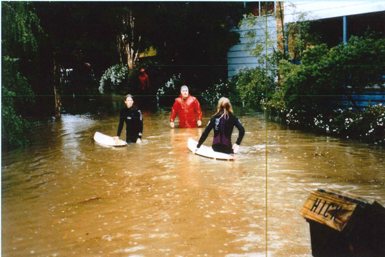
Foam/Wave Street area January 1993