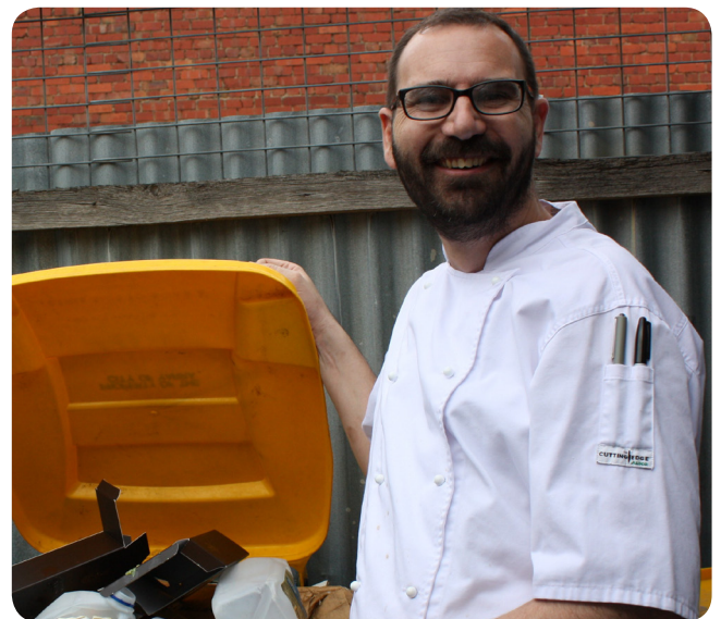
Recycling with Two Tall Chefs

One-on-one engagement and hard waste removal helped to spread involvement in recycling along the shopping strip. On the other side of Maria's Pasta's carpark is The Two Tall Chefs Cheese Shop. The owners were keen to learn about the details of recycling right, especially the difference between hard and soft plastics. They were delighted with the new council-supplied yellow corflute bins for in-store recycling and with the communal cardboard bin. "Like the recycling bins," said one Tall Chef. "Handy as!"