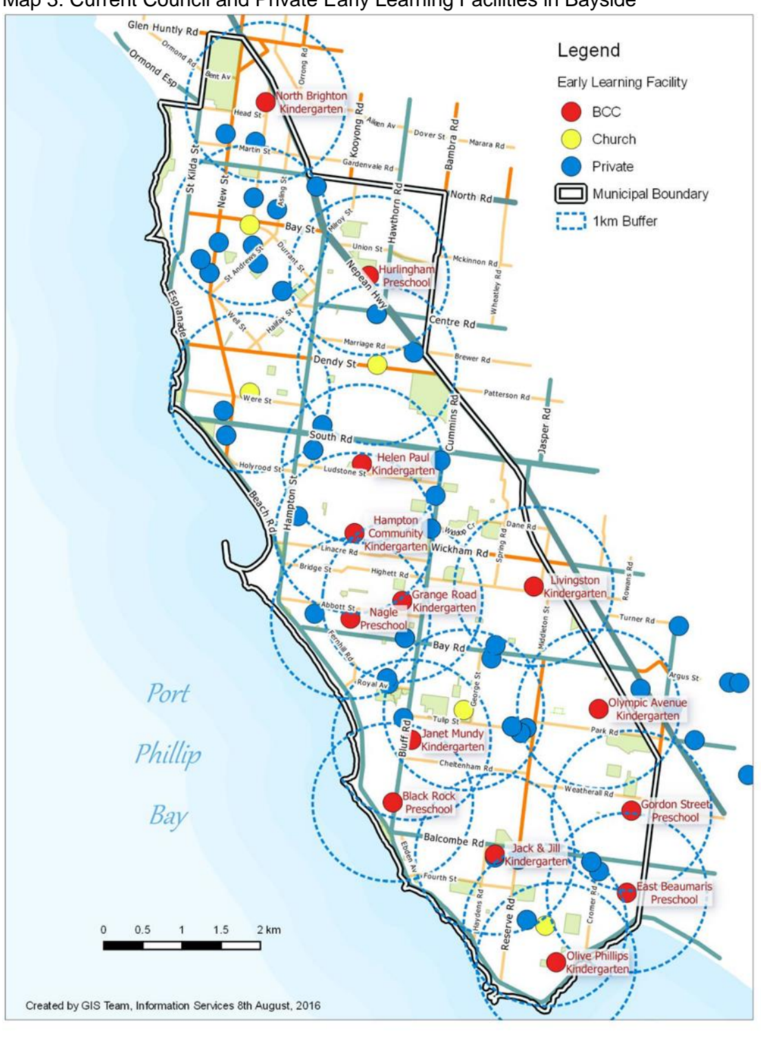
Map 3: Current Council and Private Early Learning Facilities in Bayside