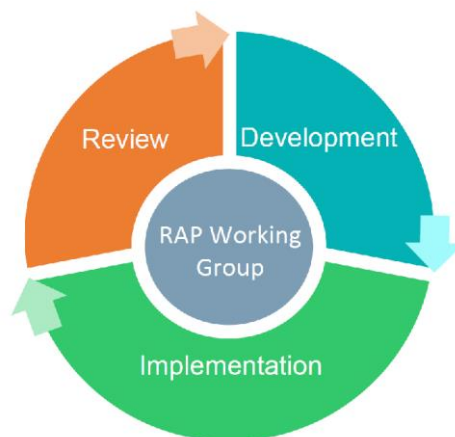
Figure 3: RAP life cycle

Reconciliation Australia is clear that the RAP is just the first step in the reconciliation journey. Reconciliation is an ambitious goal, the journey to reconciliation is a cycle of continuous learning and reviewing.