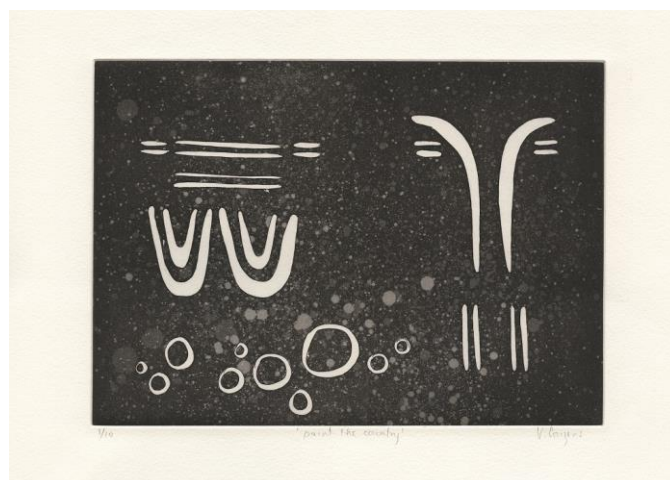
'Paint the country' by Vicki Couzens, Bayside City Council collection