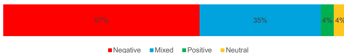
Figure 2: Survey response sentiment

‘Neutral’ responses (4, 4%) did not express an opinion (for example only quoting the section number but not providing feedback) and one contained a request that late submissions be considered for a future meeting.