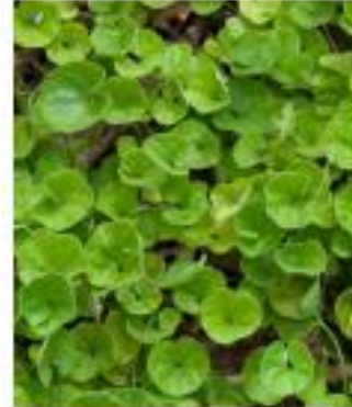
Kidney - Weed