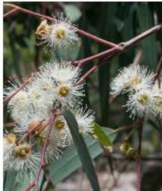
River Red Gum