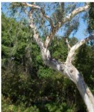
Snow Gum or White Sallee